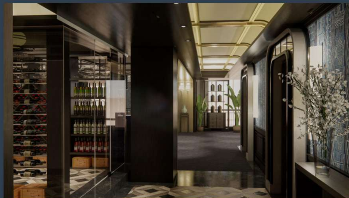
PASSAGE TO TEA LOUNGE WITH FULL SEA VIEW