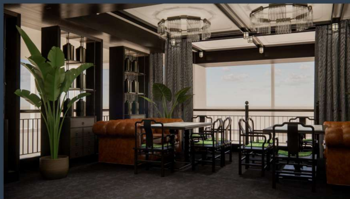
SEAVIEW TEA LOUNGE