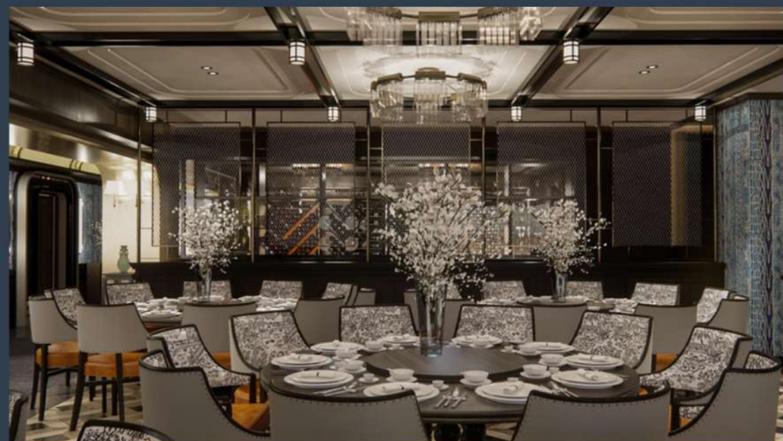
EVENT PRIVATE DINING @ DINETTE

Address: 31/F, iSquare, 63 Nathan Road, Tsim Sha Tsui