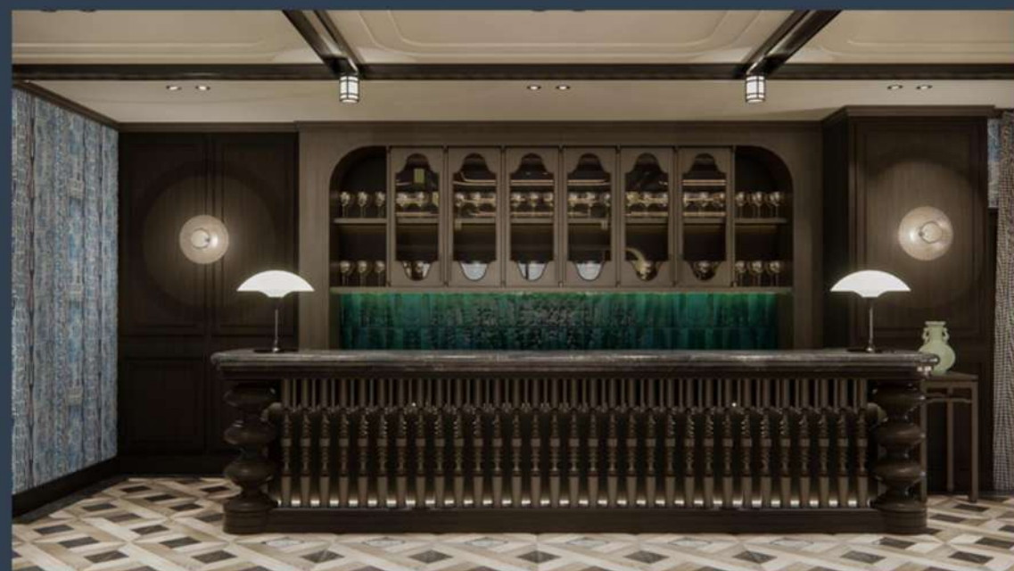
ESPRESSO COCKTAIL BAR