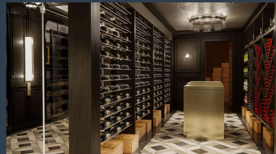
CELLAR 31 WINE TASTING TABLE