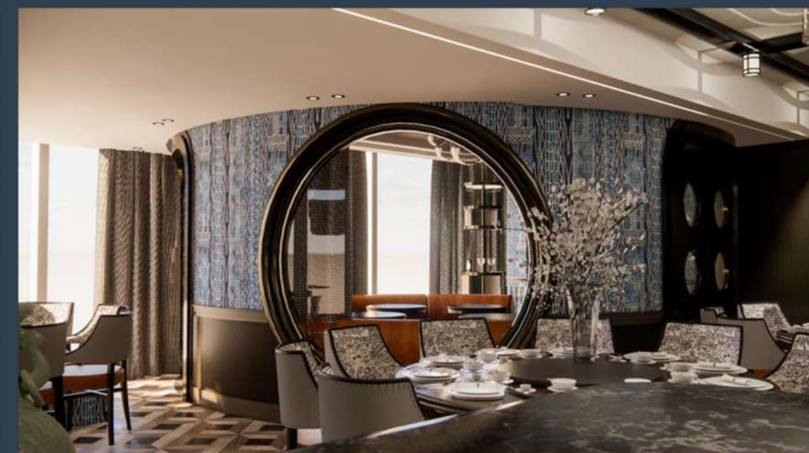
VIEW INTO MISTER DEEJAY LOUNGE